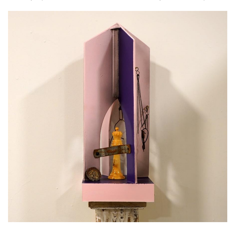
Jesse Klassen, Queens\ Crossing , 2024, mixed media, found objects on wood structure and substrate and carved wood chess piece, 19 x 6 x 6 in.