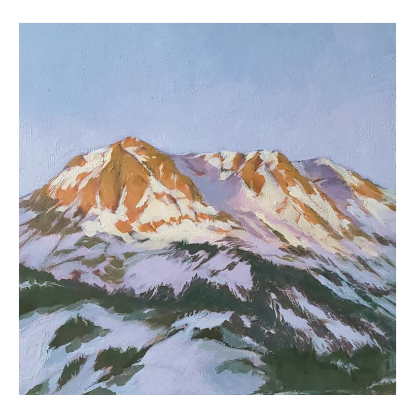
Lindsey Spellman, Colorado Peak, 2022, acrylic on wood panel, 12 x 12 in.