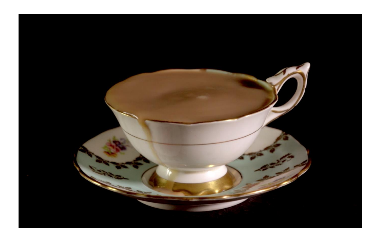
Farheen Haq, Drinking from my mother's saucer (still), 2015, single-channel video, 2:09 mins