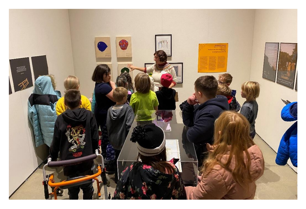
Des Pardes has been well received by educators, engaging over 1,000 students to date in school tours and inclassroom activities.