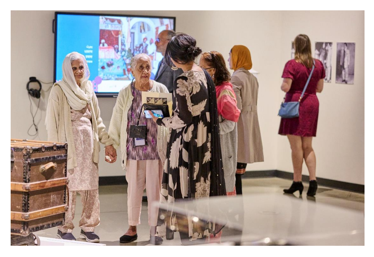
Des Pardes includes voices, stories, and ideas, drawn from a three-year community-engaged exhibition development process.