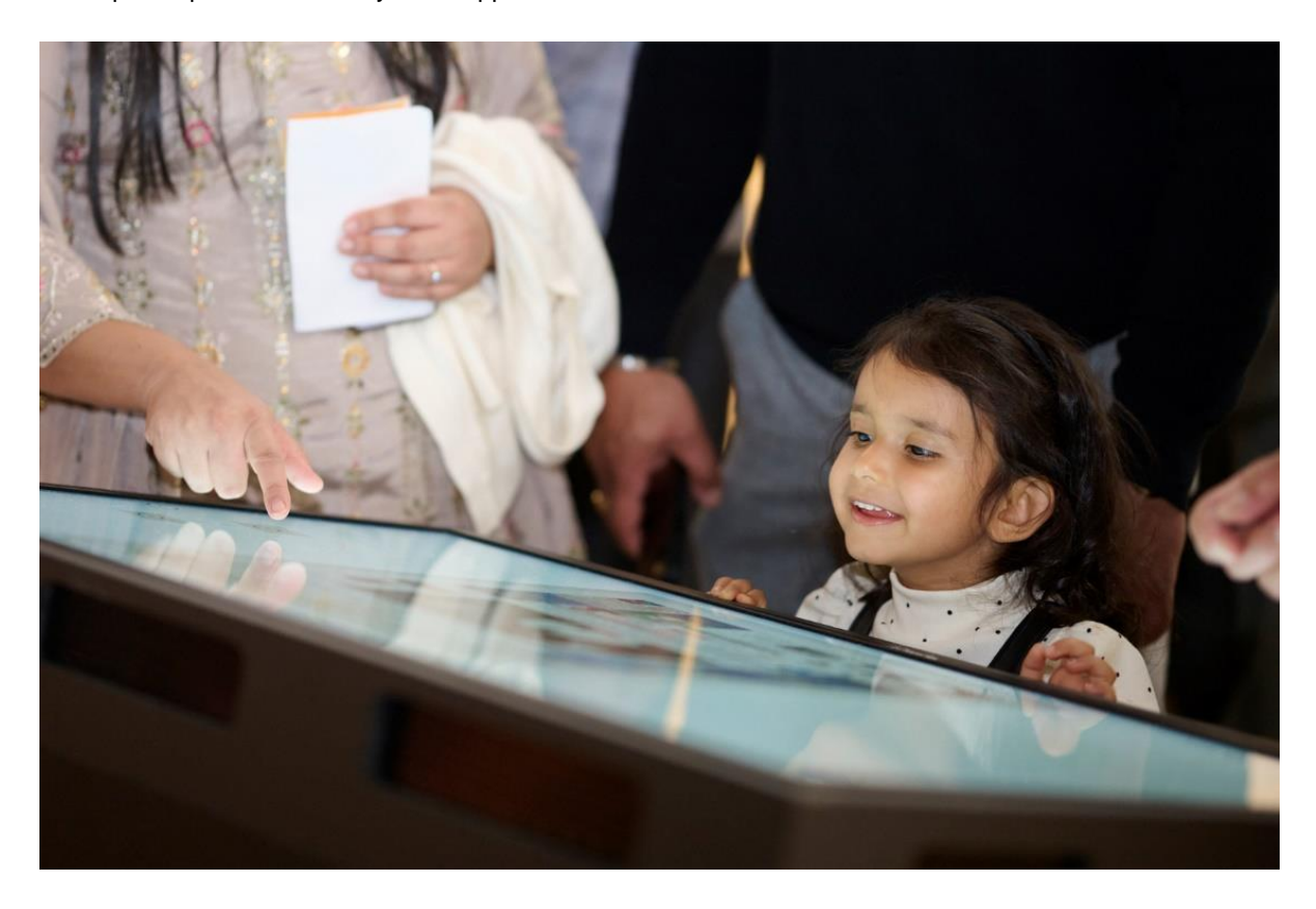
Digitized community collections are shared on touchscreen kiosks throughout the Des Pardes exhibition.