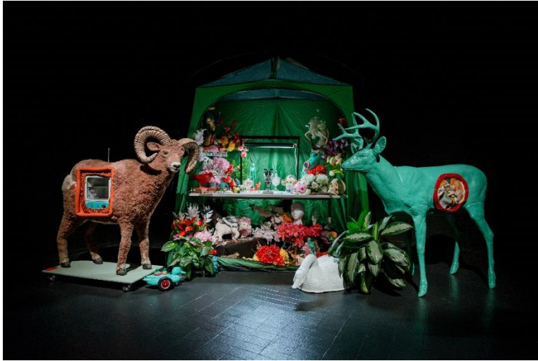
Figure 9 Jennifer Willet, Laboratory Ecologies , deer decoy, incubator in sheep's clothing, owl night light, lab supplies, tent fabric, 2017.