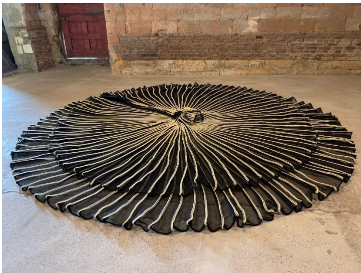
Figure 1 Karin van Dam, Lichen , wool and monofilament, 2021.

Thumbnail images (high-res versions available for download at https://tinyurl.com/4fye96y )