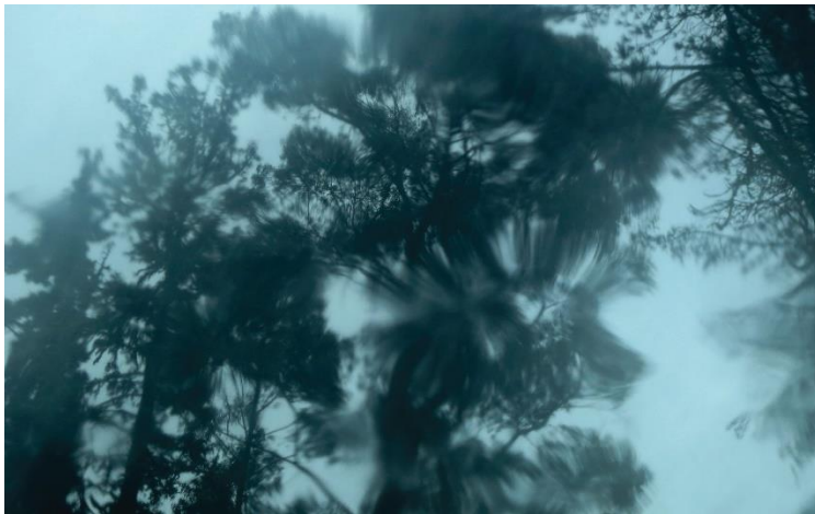
Figure 4 Ed Pien, Rain Forest 2 , digital print on archival cotton paper, 2016.