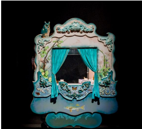
Figure 10 Jennifer Willet, The Biosafety Puppet Playhouse , performance object and sculpture, 2020.