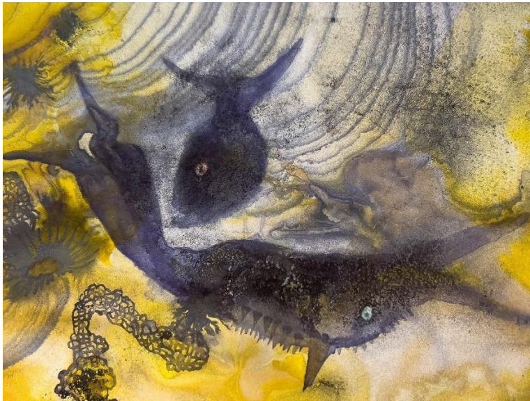
Figure 6 Ed Pien, Amidst Blue and Black Kelps , ink and coloured pencil on 3M reflective film laminated on shoji, 2023. Photo courtesy of Ed Pien