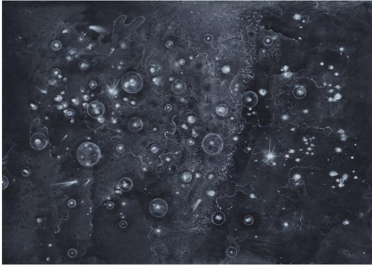
Figure 5 Ed Pien, Celestial Clouds from OceanWater Drawing: We Are Stardust series, collaboration with Halifax Harbour Ocean Water, ink and conté, 2017–2018.