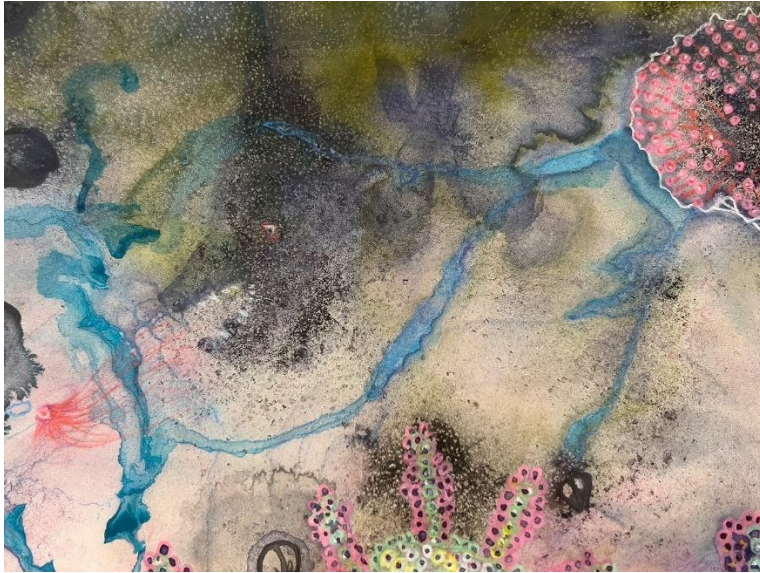
Figure 7 Ed Pien, Primordial Soup , ink and coloured pencil on 3M reflective film laminated on shoji, 2023.