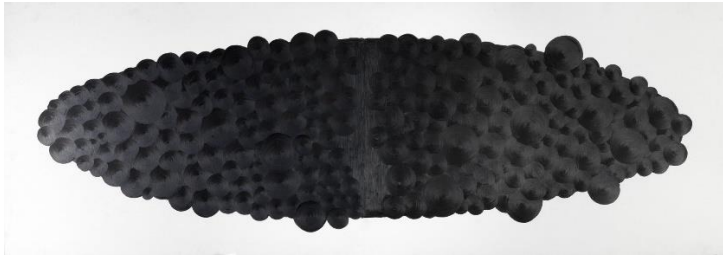
Figure 2 Karin van Dam, selection from Coal series, three photographs, 2021/2023.