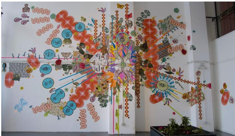
Figure 11 Jennifer Willet, When Microbes Dream , installation dimensions variable, 2022. Courtesy of Jennifer Willet and Ectopia, 2022