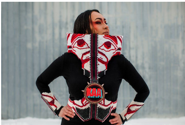
Catherine Blackburn, The Churchill Challenger , 2018, inkjet on dibond, 48 x 60 in.