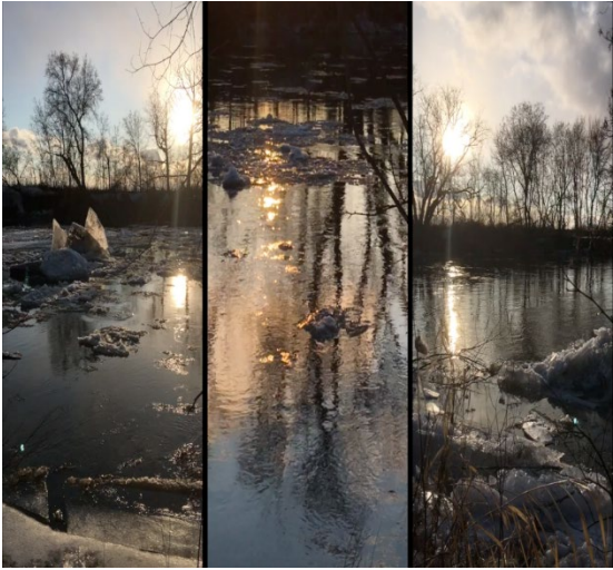
Leah Decter, Listen (video still), 2020, single channel colour video with sound, 6 minutes.