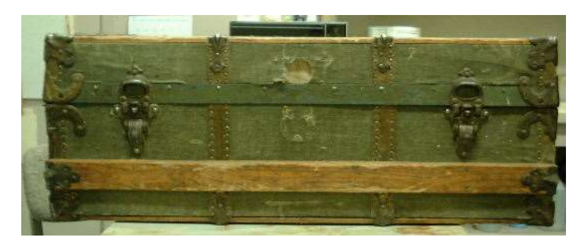
2004.8.2 Belonged to Gladys Hambly of Alberta. Center lock and side handles missing.